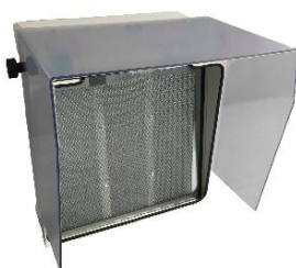
Small visor VHI3PP