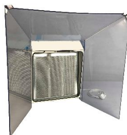
Funnel visor VHI3GP