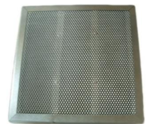
Active carbon filter FCP1