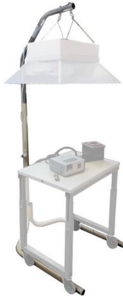
HI9P : overhead hood