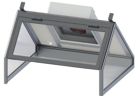
HI7VP : pyramidal fume hood