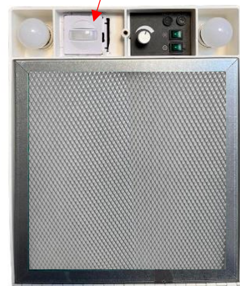
view without cache