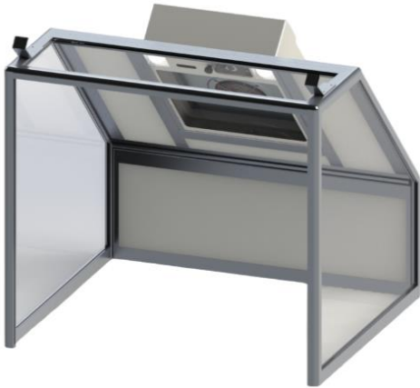
HI5VP : straight fume hood

The HI9P , HI5VP , HI7VP exhaust hoods offer an optional automatic lighting and motor activation function.