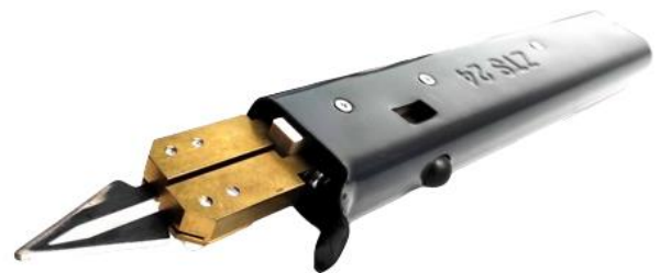
Thermal cutter ZTS24 ( blade LAMT012/0,6 )