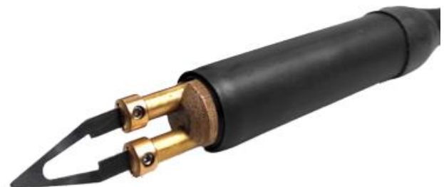
CCT thermal knife ( blade LAM1 )