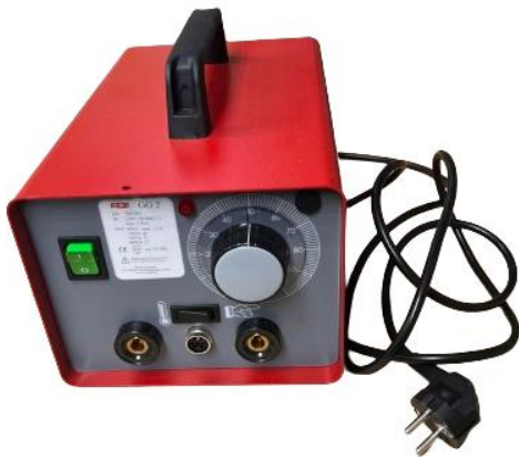
Control box GG2