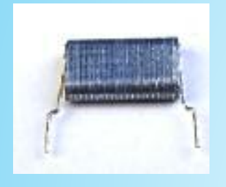
SP27.02 CUT AND PITCH SPREAD