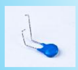
SELECTION OF SP27.06 FORMS ON DEMAND