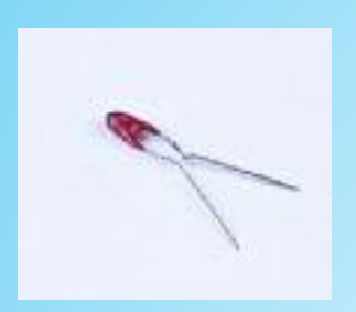
SP27/A 01 CUT AND FORM WITH KINKS