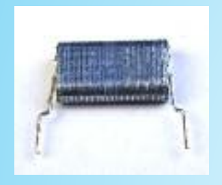
SP27/A 02 CUT AND PITCH SPREAD