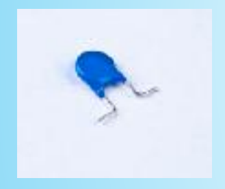
SP27.04 CUT AND SMD OUTWARD FORM