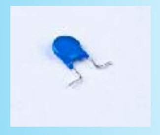
SP27/A 04 CUT AND SMD OUT-WARD FORM