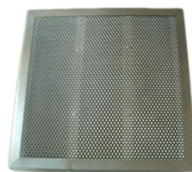
Active carbon filter FCP1