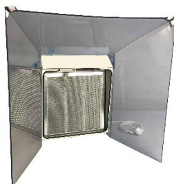
Funnel visor VHI3GP