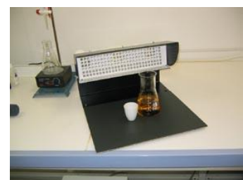
AP1 Suction plate