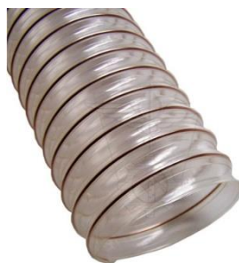
Polyurethane flexible hose