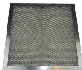
FAP1 Particle filter