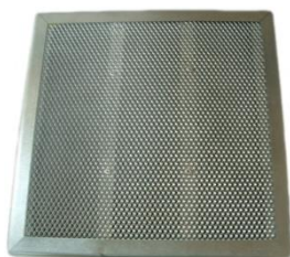
FCP1 Active carbon filter