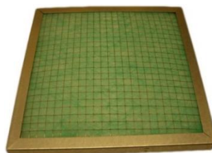
Dust filter FPP1