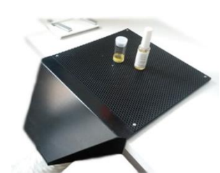
AP2 Suction plate