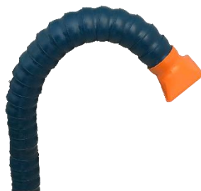
Standard segment suction arm