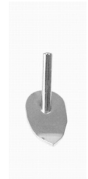
SPATULA « MM » 52x25