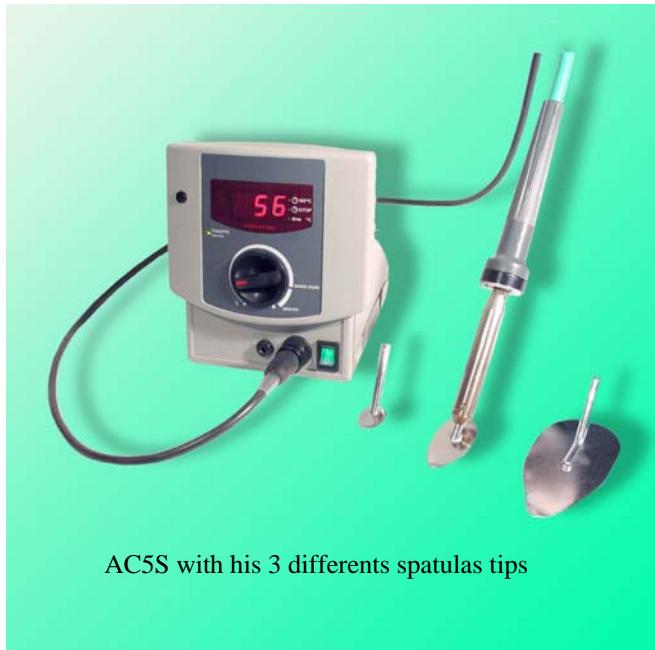
AC5S with his 3 differents spatulas tips

AC5S is a special Appliance designed for repairing, reworking...in a large field of Works as: