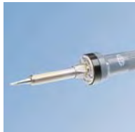
Fer 50W Soldering iron