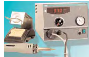
Centrale à dessouder 4601DC desoldering station