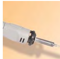
Fer à dessouder 100W Desoldering iron