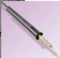
Microfer 40W Soldering microiron