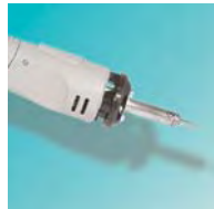
Fer à dessouder 50W Desoldering iron